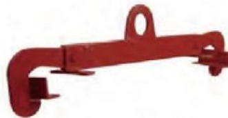
Vertical Drum Clamp LR