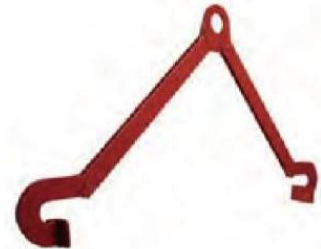
Horizontal Drum Clamp LH